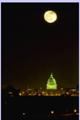
Caption de- scribing picture or graphic.

“To catch the reader's attention, place an interesting sentence or quote from the story here.”