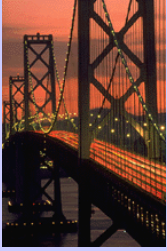
Caption de- scribing picture or graphic.

“To catch the reader's attention, place an interesting sentence or quote from the story here.”